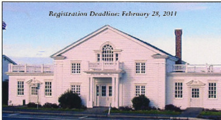
Registration Deadline: February 28, 2011

Re-enactors and their guests are welcome, attire is mid-19 th century period or formal dress (NO hobnailed brogans please). Potluck dinner & dessert buffet, please bring either a main dish, or side dish and dessert. Punch, coffee, tea & cocoa will be provided. If you plan to bring alcohol, please pay $5 extra to cover the liquor license fee. We look forward to seeing you there!