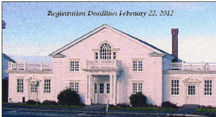
Registration Deadline: February 22, 2012

~ Please note, space is limited, so send your reservation in early! ~