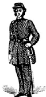
Expires July '05

For Sale Ammo box, painted and stenciled, 14 3/4 L X 10 3/4 W X 7 H outside dimension, $27.50. Ammo box, unfinished, $20. Ammo box, duplex (two ammo boxes joined together to make a deeper box; looks like two stacked), painted and stenciled, 14 3/4 L X 10 3/4 W X 14 H, $45. Ammo box, duplex, unfinished, $35. Hard Tack box, stained and stenciled, 24 L X 16 W X 12 1/2 H, $45. Hard Tack box, unfinished, $35. Hard Tack box, insulated (used as cooler), $55. I prefer to deliver these at events I will attend, but will ship them for additional cost if you prefer. Email questions or orders to Don Secor with the U.S. Medical at falsestar@hotmail.com. Please use "CW Boxes" in the subject line.