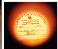
Label through blow hole of snare